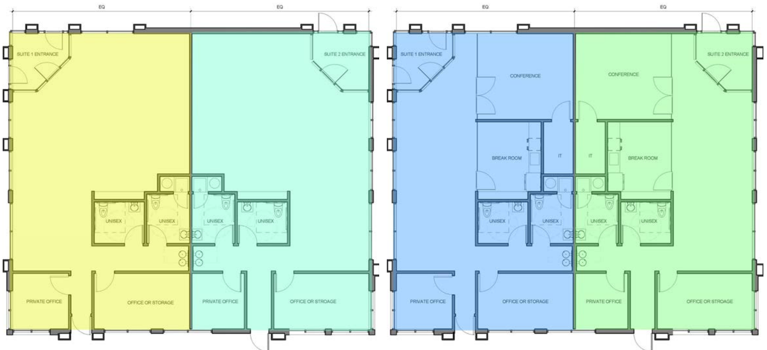
Potential Multi-Tenant Retail Plan